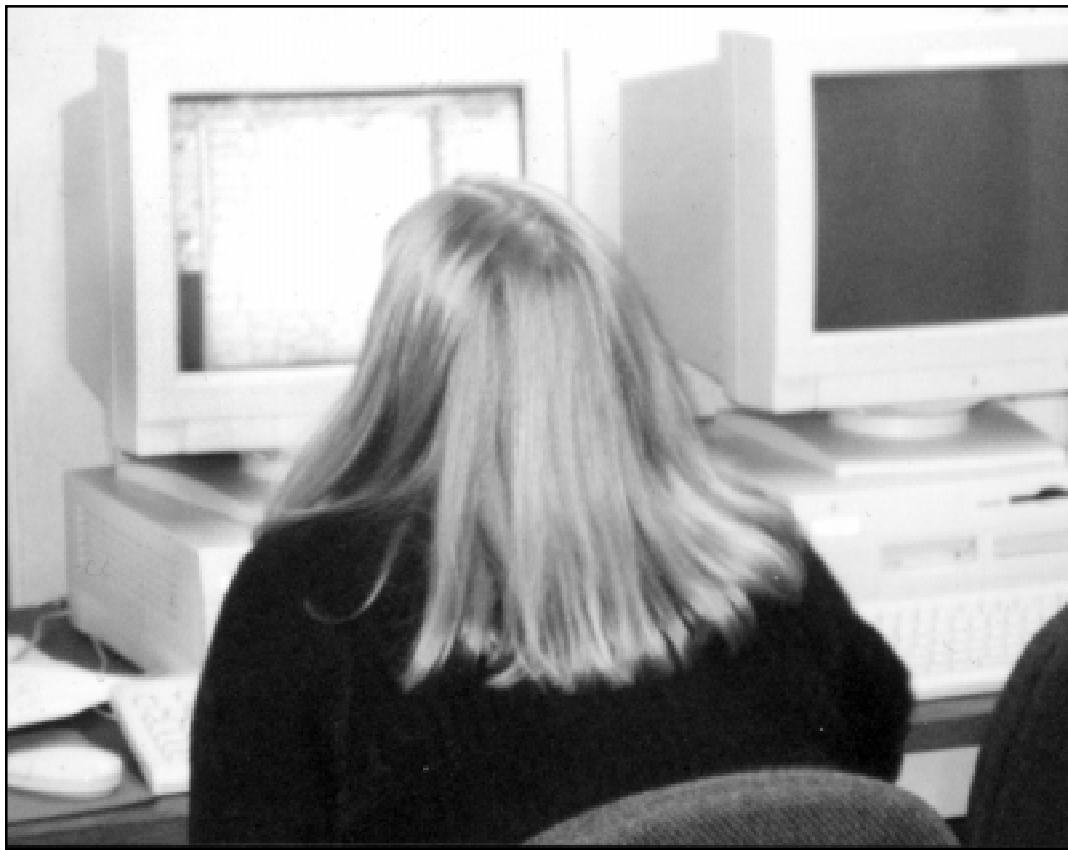
A BGSU Methods Class student looks at software in NWOET's Lab. Students are encouraged to select and use the software available through NWOET.

All BGSU student teachers and Methods Class participants are welcome to use the services of the Foundation at any time.