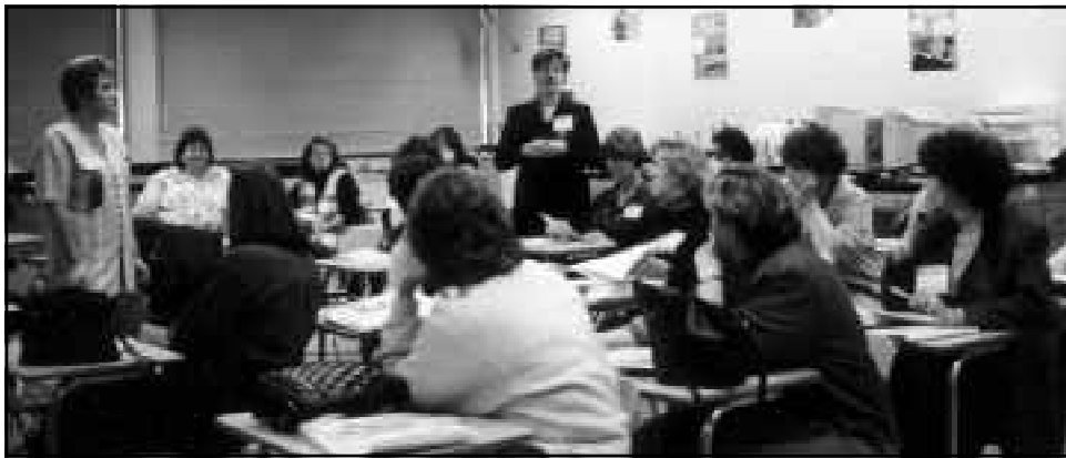
TechConference '98 fills classroom presentations.