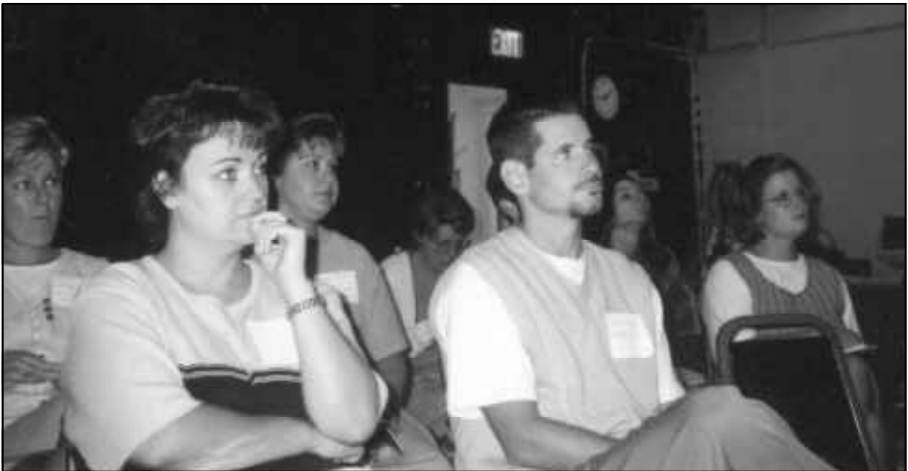
Northwest Ohio sixth grade teachers gear up for this year's NewSix programs.

Apr 26 Hardin Northern Elementary, Hardin Northern Local Schools