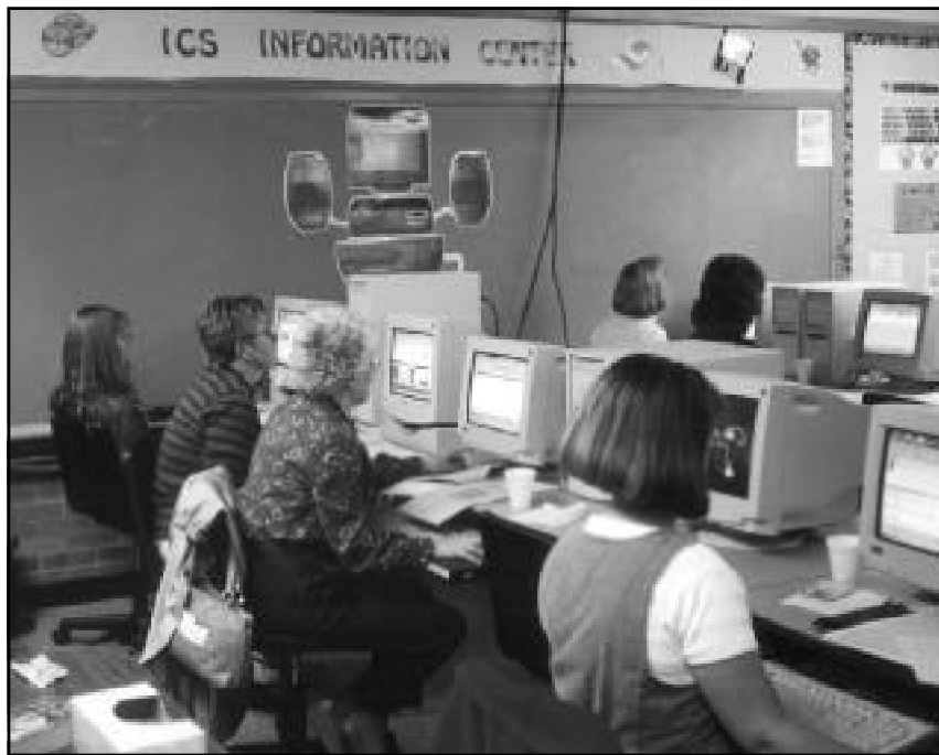
Microsoft Word was the topic of an inservice held recently at Immaculate Conception School in Port Clinton. Workshops like this one can be custom designed for your school's needs.

02/14 Mufaro's Beautiful Daughters 02/15 The Bionic Bunny Show 02/16 Bugs 02/17 The Robbery At The Diamond Dog Diner 02/18 A Three Hat Day 02/21 The Purple Coat 02/22 A Three Hat Day 02/23 Rumpelstiltskin 02/24 Best Friends 02/25 Meanwhile Back At The Ranch 02/28 My Little Island 02/29 The Life Cycle Of The Honey Bee 03/01 Keep The Lights Burning, Abbie 03/02 Chickens Aren't The Only Ones 03/03 The Paper Crane