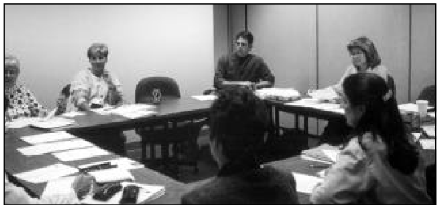
Teachers and administrators from the Toledo Diocese met at NWOET to discuss minimum technology skills needed for teachers and students.

If the classroom teacher is to be at the forefront in the use of technology, a solution has to be found. Is there a solution? Probably more grant writing!