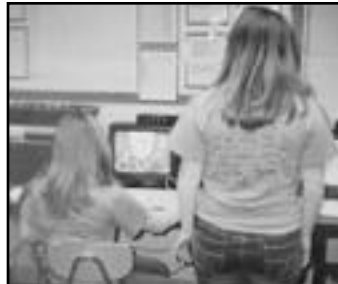
Two students from the broadcasting/television production classes at Hopewell-Loudon High School begin the editing process for the HLTV news show.