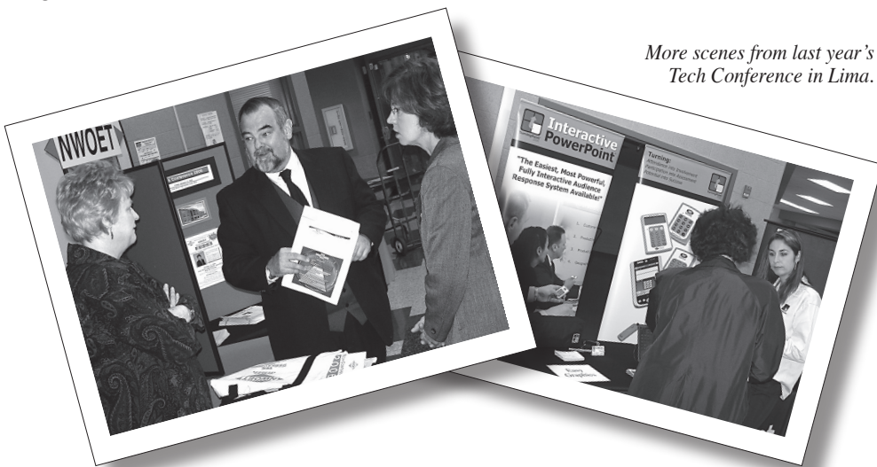
More scenes from last year's Tech Conference in Lima.

For more information and to register, go to our Web site ( www.nwoet.org ) and click on the conference link. There is also a registration form on the back of this issue of Scanner which you may fill out and mail to 245 Troup Ave., Bowling Green, Ohio 43403.