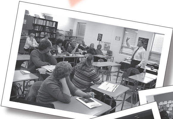
Scenes from last year's Tech Conference in Lima.

10% OFF Register by Oct. 2 Mention code: "Post It"